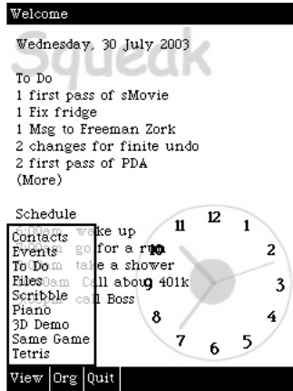
Fig. 4. Fauré View Menu with Tetris Menu Entry

found on top of the game area are now arranged in the bottom row of the PDA UI where one would have placed them in the first place if the game would have been designed to run in the PDA from the beginning.