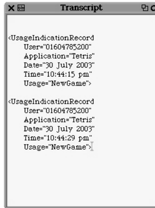
Fig. 5. Posted Tetris Usage Indication Records

The following listings illustrate how this adaptation was achieved. The first listing shows the method that gets invoked every time a customer presses the ‘New Game’ button ( TetrisBoard>>newGame ): Tetris starts over with a new game.