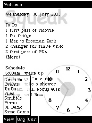
Fig. 1. Fauré Welcome Screen

When we launch our PDA application, its welcome screen shows summarized list of our things to do and our personal schedule (Fig. 1). Via the view menu, we can reach to our full contacts database, all of our social events and things to do, a little sketch pad, a piano-like music instrument, and a demonstration of the 3D rendering facilities of Squeak.